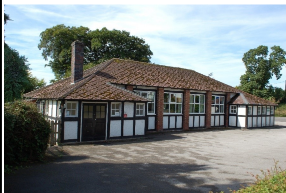
Brailsford Institute Main Road Brailsford

E-mail clerk@brailsfordandednastonpc.org.uk